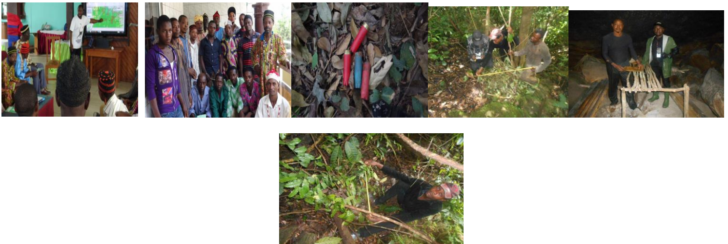
Conservation of the Cross River Gorilla in the Water Head Area