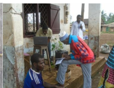
NTFP Nusery Harmonising Non Timber Forest products in to farming Systems.